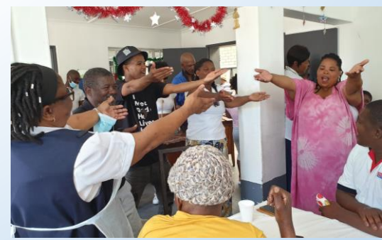
Rocking to the sounds of Mzanzi Marimba Jazz Band